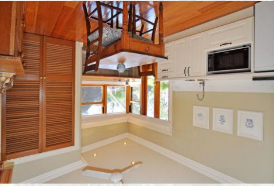
The well appointed kitchenette with Nespresso coffee maker