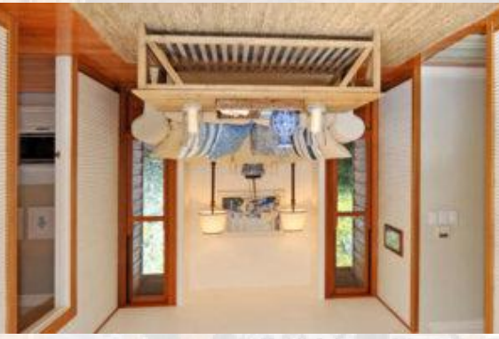
Lounge with views of the garden & brook